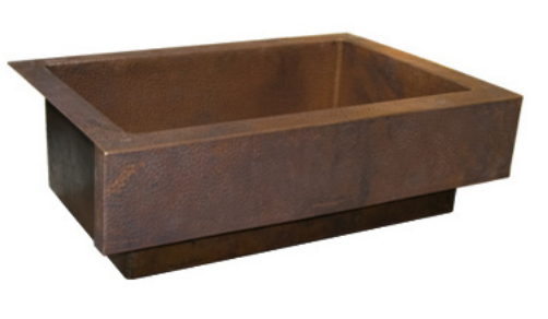
CPS291- Antique CPS591- Brushed Nickel