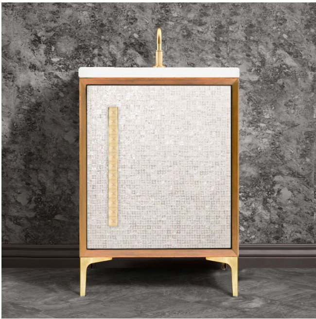
Shown in SB

Linkasink warranties our product to be free from manufacturing defect for the life of the product. Warranty does not cover improper care, neglect, abuse or normal wear-and-tear.