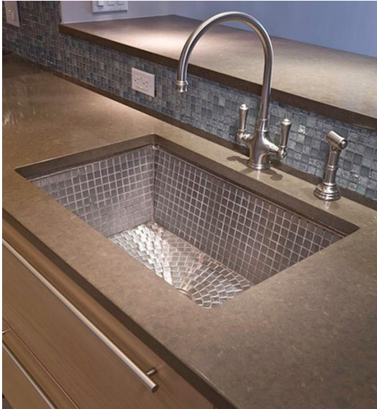
V031 UM with D007 SS Shown