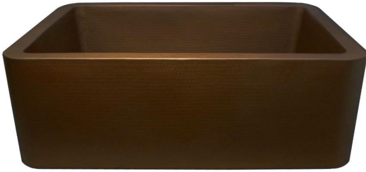
Shown in DB