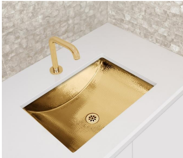
Shown in PB finish