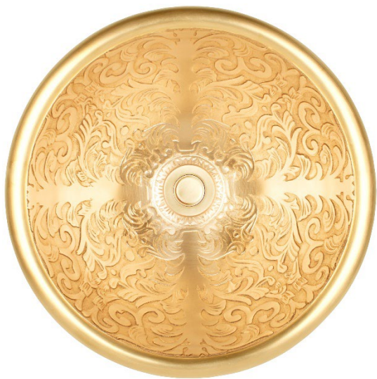
Shown in UB

Linkasink warranties our product to be free from manufacturing defect for the life of the product. Warranty does not cover improper care, neglect or abuse or normal wear-and-tear