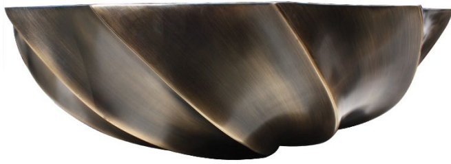
Shown in AB finish