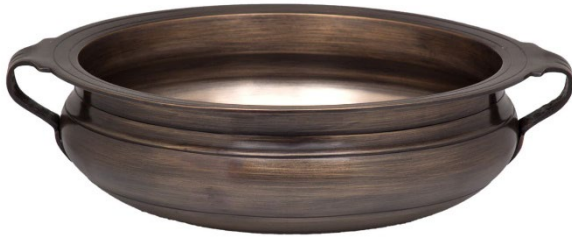
Shown in AB