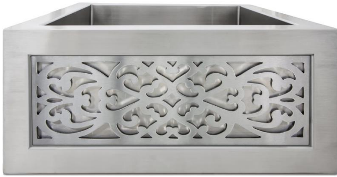
C073-3.5 SS shown with PNLs105 SS