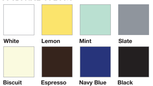
Color variations possible due to printing constraints.